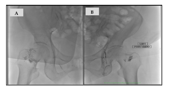
Figure 1: (A) Showed Lipiodol injection into the right inguinal lymph nodes while Figure 1(B) Showed injection of Lipiodol into the left inguinal nodes. Note that contrast opacify lymphatic network at the left inguinal region.

The desired area was cleaned and draped. A total of 5 mls of Lipiodol was injected under ultrasound guidance into the lymph nodes at the bilateral inguinal regions (Figure 1), (2.5 mls on each side) at the rate of 1 ml/minute. Dissemination of lipiodol was monitor under intermittent fluoroscopic screening.