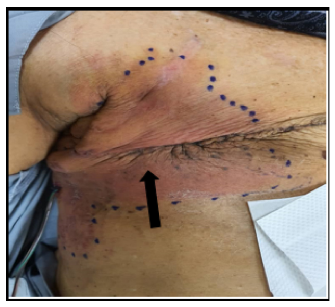
Figure 3: Day 2 post injection Lipiodol, patient developed skin erythema (black arrow) at the lateral aspect of the right mastectomy site. She was also having fever hence, surgical team treated as cellulitis. It resolved after 4 days of antibiotics.

In terms of the chylous leakage, the output started to reduce 48 hours post procedure. The output was reduced to 500 mls/day however, it was mainly hemoserous