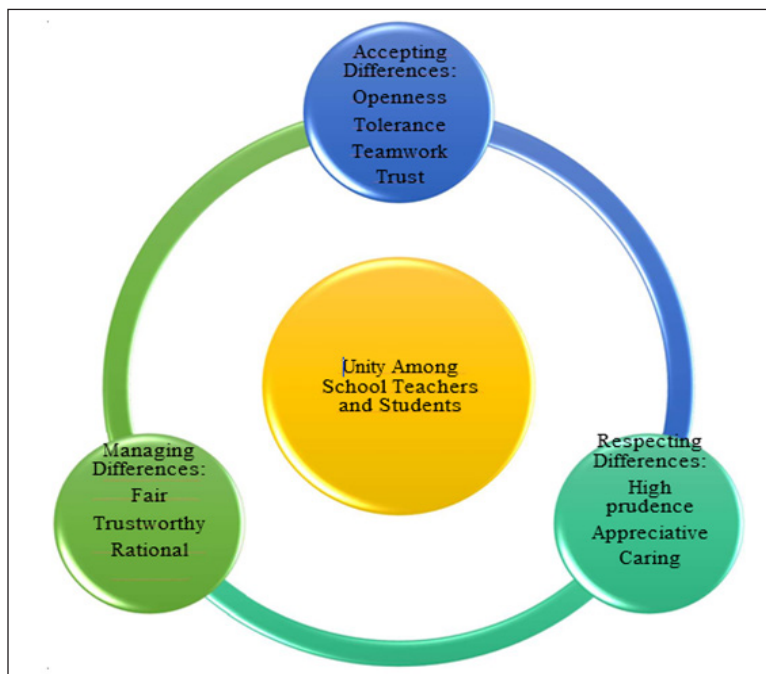
Figure 2. Unity model for school teachers and students Source: Ministry of Education (2014)

As leadership is a process of persuading or influencing others to act and to achieve an organizational goal (Kouzes & Posner, 2003), or about a group of people (leaders and followers) who interact, communicate, and influence each other to accomplish a common objective (Yukl, 2013), there is no doubt that principals play a pivotal role in inculcating unity values and in persuading school community to unite. By sharing and disseminating the goal of unity to all teachers, principals can change the behaviors of the teacher (Hughes et al., 2002). Besides, unity must be a collective aim and must engage all members of the organization (Harris et al., 2013).