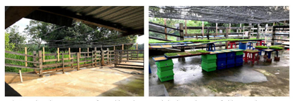
Figure 1. A used cattle pen was transformed into the open-air hydroponic green fodder growing system

A used cattle pen-sized 35 ft width and 27 ft length were sheltered with polyethene sunshade netting to protect green fodders from heat before installing the openair hydroponic fodder growing system (Figure 1). The cattle pen was also fenced with galvanized welded iron wire mesh (bottom) and zinc sheet (top) as a protective measurement from rodents. Two water tanks were used as the water storage system: Tank 1 was fed by clean tap water, and Tank 2 was fed by water from an outlet at the bottom of Tank 1 (Figure 2). Two centrifugal pumps (Model CPM-158, AC 200-240 V ~50 Hz, Victa<sup>TM</sup>, Malaysia) connected to Tank 2 pumped water to a filter and then to the water channels (Figure 3). Polyethene pipes sized 25 mm were used as water-conducting networks from tanks, centrifugal pumps, filters, and water channels. The water channels drained water into eleven water ducts of polyethene pipes sized 16 mm. The water flow of five ducts was drained from pump 1 and another six ducts from pump 2. The water ducts were spaced 2 ft apart, and plastic misting spray nozzles were placed at 2-ft intervals along these water ducts.