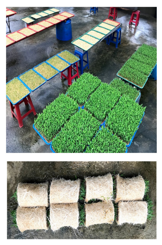
Figure 4 . The hydroponic maize sprouts, which were grown for seven days

allotted to different single pent sized 3.5 ft width \times 4.3 ft length on a raised slatted floor, which is equipped with water nipple. The goats were randomly grouped into three treatments, which consist of Treatment 1 (T1) fed with 100% fresh Napier grass and concentrate as Control group, Treatment 2 (T2) with 100% HMS and concentrate, and Treatment 3 (T3) with 100% HMS only, respectively. The concentrate (Table 1) was fed at the 500 g/goat rate in the morning (0830 h) daily.