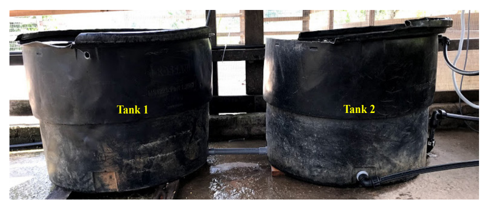
Figure 2. A two-tanks system was applied to ensure a continuous supply of water