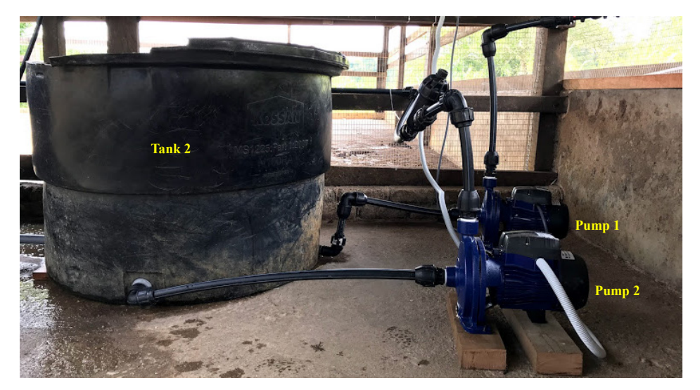
Figure 3. The water-conducting network from Tank 2, two centrifugal pumps and filters