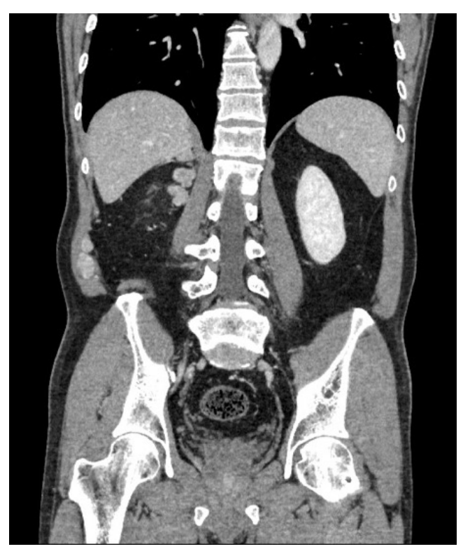
Figure 1: Contrast-enhanced CT abdomen (coronal plane) shows the presence of multiple homogenously enhancing lobulated nodules at the right paranephric region as well as the right posterior-lateral abdominal wall which suggestive of metastatic nodules.

complications and failed treatment. It is our aim that the patient and their next of kin to understand the procedure completely. There is no premedication before the procedure except for his regular antihypertensive medication.