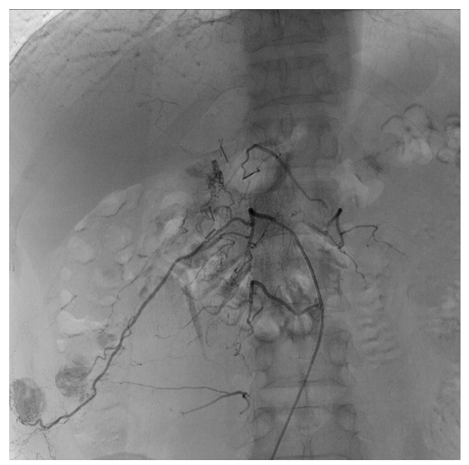
Figure 2: Pre-embolization angiography shows the main arterial supply to the right posterolateral abdominal wall nodules by the 1st right lumbar artery

The post embolization brachial blood pressure returns