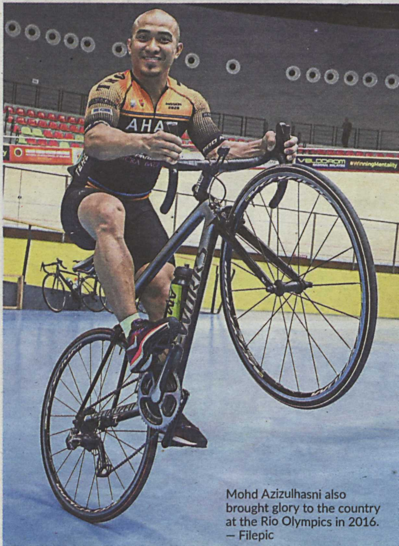
Mohd Azizulhasni also brought glory to the country at the Rio Olympics in 2016.

Ministry says full support will be given to athletes to win coveted medal at Tokyo Olympics