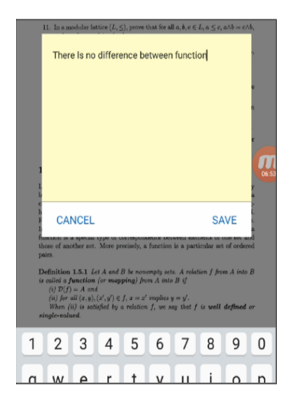
Figure 2: Screen shot of mobile e-book with annotation feature