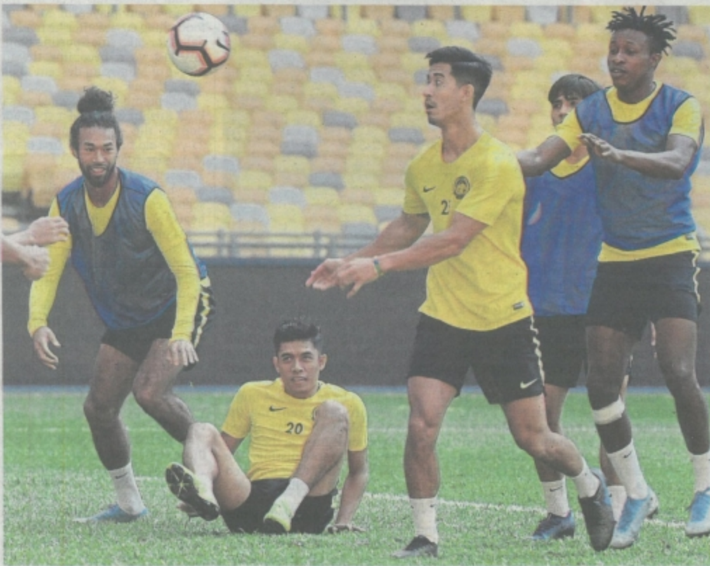
Staying on the ball: The Malaysian players at a training session at National Stadium in Bukit Jalil yesterday.