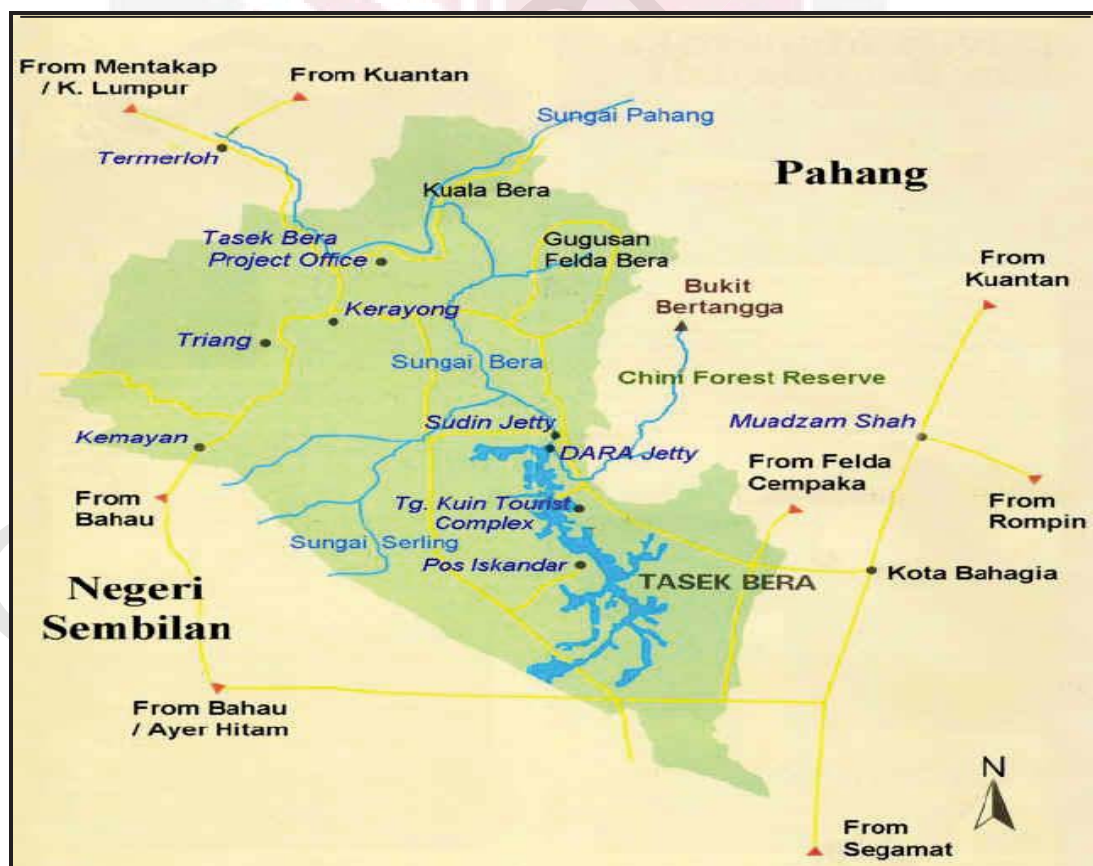
Figure 1.1 : General Map of Tasek Bera Wetland

Tasek Bera is a freshwater marsh lake located in the middle of the watershed area of the south central part of Peninsular Malaysia Pahang River basin ( Figure 1.1 ). It is a unique lake and has been labeled as a watery refuge, freshwater swamps, a wetlands mysterious legendary lake, wetland forests or wetlands that are hidden in Malaysia. All this explanation is in recognition of its unique features as a wetland habitat in Malaysia and Asia, and was gazetted as a RAMSAR site. RAMSAR Convention (Convention on Wetlands of International Importance, especially as a Waterfowl Habitat) is an international treaty that has been signed in the city of RAMSAR, Iran on February 2, 1971 between governments as a framework to conserve potential natural wetlands. The treaty was implemented on December 21, 1975.