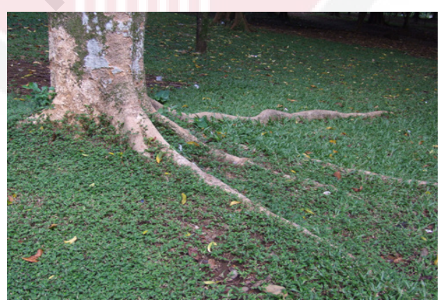
Figure 1.6: The Barks of Dysoxylum acutangulum