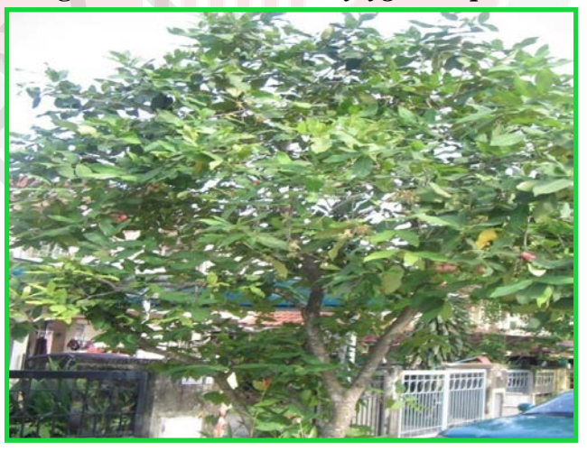
Figure 1.3: The Tree of Syzygium aquem