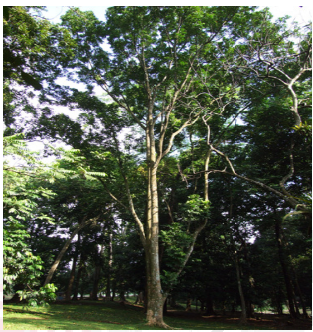
Figure 1.4: The Tree of Dysoxylum acutangulum