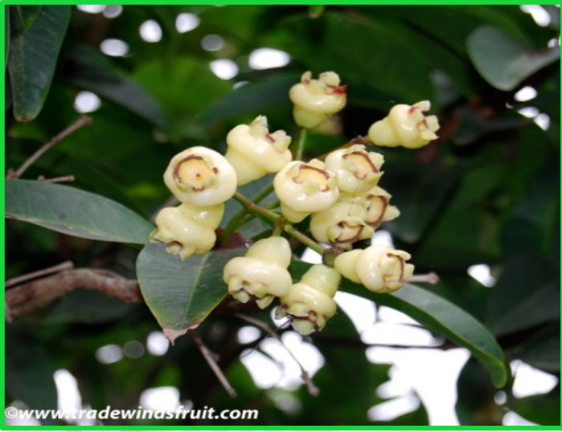
Figure 1.2: The Buds of Syzygium aquem