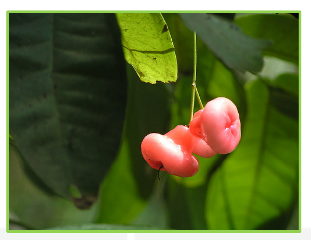
Figure 1.1: The Fruits of Syzygium aquem