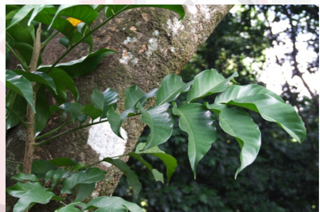
Figure 1.5: The Leaves of Dysoxylum acutangulum