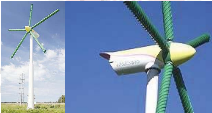
Figure 1.3: Spiral Magnus wind turbine prototype (MECARO Co. Ltd, 2007).

The significant different of MWT compared to conventional wind turbine is that blades that used to harvest wind energy. Furthermore, to increase the performance of MWT, innovative design of the rotating cylinder was developed. Several researcher used rotating cylinder with fin showed promising results improving lift and torque of MWT (Jinbo, Ceretta Moreira, et al., 2014; Murakami, 2010). Figure 1.3 shows the MWT prototype developed by Japan utilizing spiral fins that coiled around the rotating cylinder blades. Nonetheless, cylinder with spiral fins will increase the complexity of the cylinder blades design.