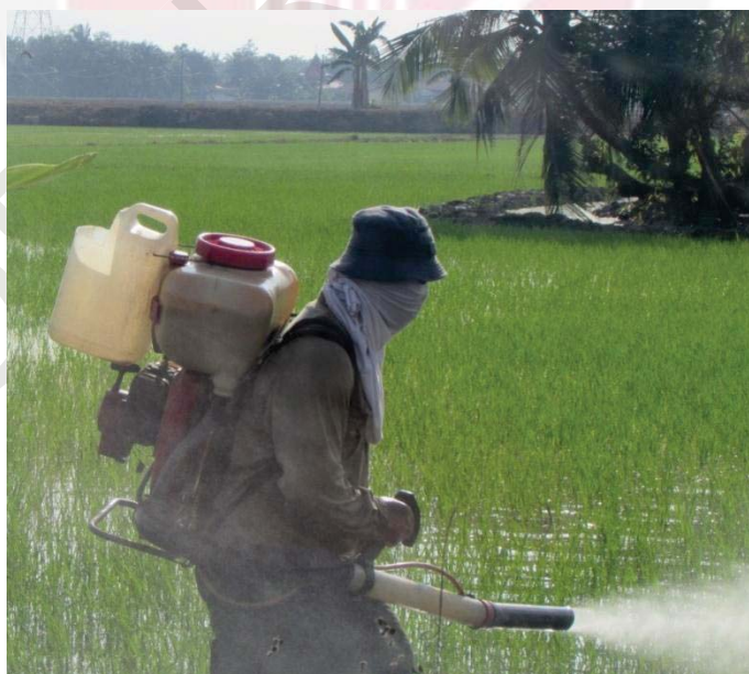
Figure 1.2: One of the paddy farmers in the study area who used an old t-shirt to cover their breathing zone during spraying activity