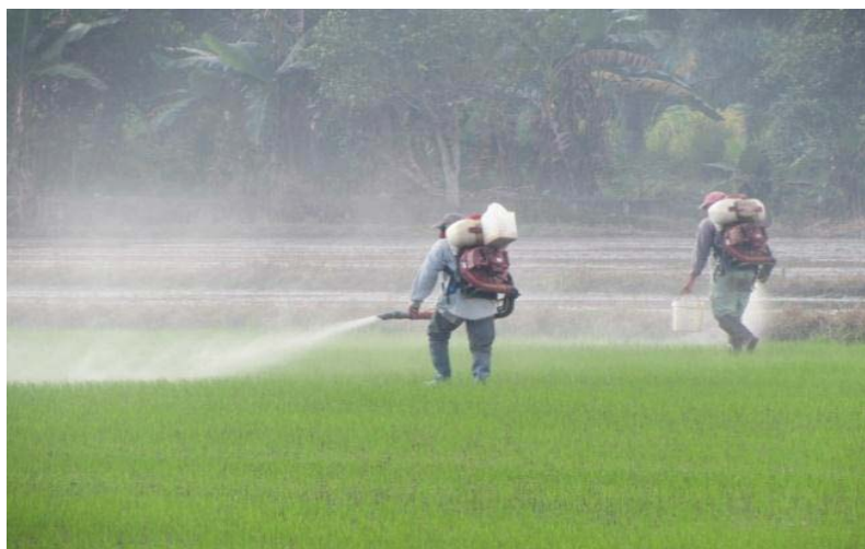
Figure 1.1: Spraying activities by the paddy farmers in Kampung Sawah Sempadan , Tanjung Karang, Selangor

The final list of target compounds contained a total of 13 compounds, which were azoxystrobin, buprofezin, chlorantraniliprole, difenoconazole, fipronil, imidacloprid, isoprothiolane, pretilachlor, propiconazole, pymetrozine, tebuconazole, tricyclazole and trifloxystrobin.