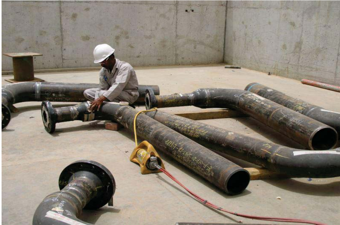
Figure 1.1 : Non-Destructive Test (NDT)

One of the most techniques used in NDT is Radiography which is based on the transmission of X-rays or gamma-rays through an object to produce an image on radiographic film (Figure 1.2). This method is used for inspecting several types of welded assemblies such as pipe-lines, boilers, pressure vessels etc. Inspected zones may present multifarious defects such as porosity, inclusions, cracks, lack of penetration, lack of fusion etc , Evaluated by the NDT criteria (Nafaa,2004) .