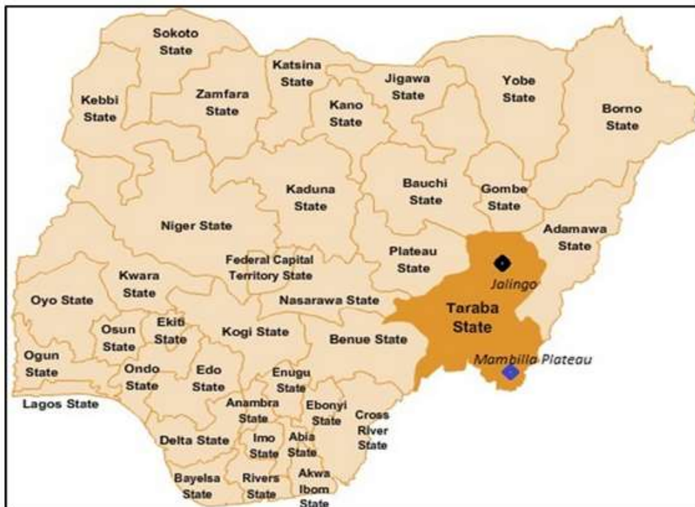
Map of Nigeria showing the location of Taraba state