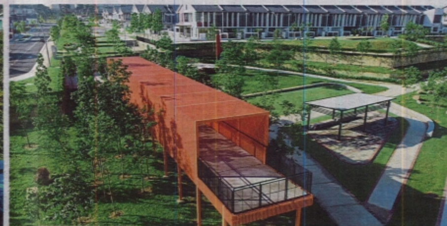
Elmina Central Park in Elmina West, Shah Alam, is vying for honours at the MLAA 2019.