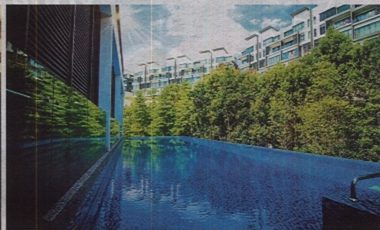
Sunway Montana in Desa Melawati, Kuala Lumpur, has also been recognised at MLAA 2019.