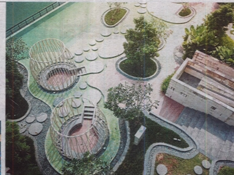
Puteri Cove Residences and Quayside in Puteri Harbour Iskandar, Nusajaya, Johor, has also caught the attention of MLAA judges.