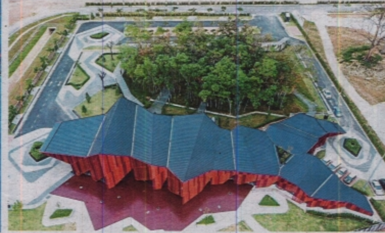
The development in Taman Irian Bayu, Seremban is up for an award too.