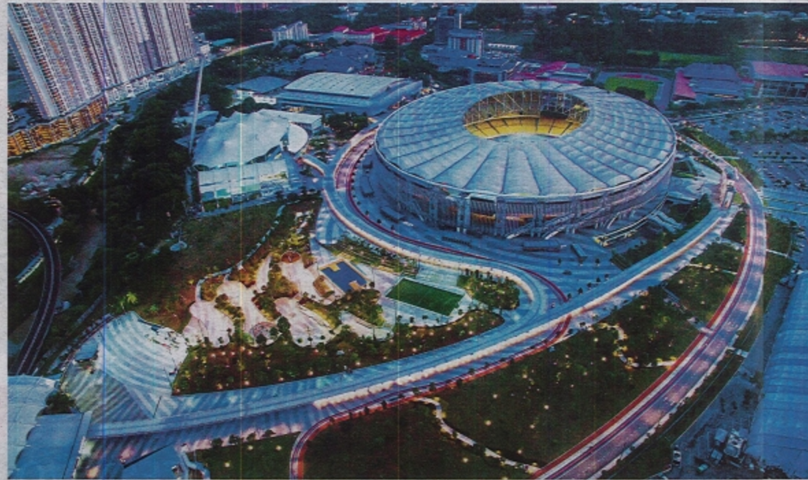
Kuala Lumpur Sports City in Bukit Jalil, Kuala Lumpur, is one of the developments nominated at the Malaysia Landscape Architecture Awards 2019.

Legislation will ensure those in field are held accountable for the work they do, says association president