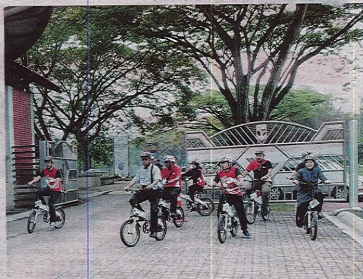
UPM encourages students to ride bicycles to reduce carbon on campus.

displayed to provide the campus community opportunities to take proactive measures, in stages, as a show of support in promoting UM as one of the prominent eco campus models at the local, regional and international levels in tandem with its status as a leading university in research and education.