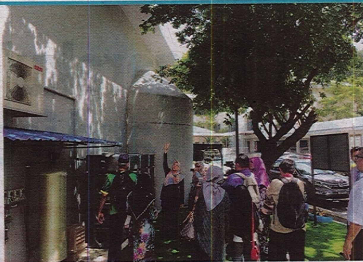
A look at the rain harvesting system at the eco surau in UM Academy of Islamic Studies.