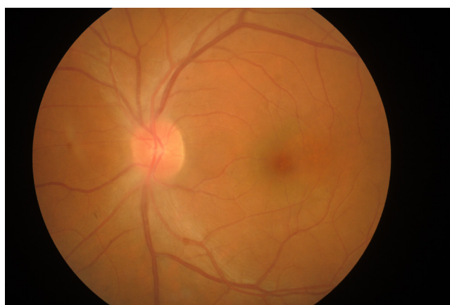
Figure 4 : Left eye disc swollen resolved (After completed treatment)