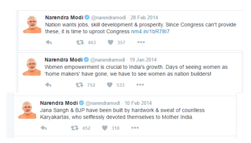
Figure 3. Notion of citizens are labourers

economic ensure that the nation building process is a success. Thus, the concept of labourers is mapped on the citizens because citizens are lower in the hierarchy to the ruling class. This finding opposes Charteris-Black's (2013) notion of SOCIAL ORGANISATION IF A BUILDING that emphasises on teamwork between political figures and citizens in the process of nation-building. Meanwhile, the findings of this study focused on citizens as labourers who engaged in the physical work of helping the nation to build a solid edifice. Figure 3 displays Modi's use of the concept of citizens as labourers in his tweets.