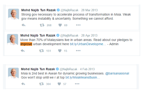
Figure 2. Concept of politicians as nation constructors

The metaphors suggest that Najib and Modi, as constructors of buildings, aim to create a comfort zone for their citizens through the implementation of various projects. The construction of the concept of BUILDING in the national election campaign portrayed a consistent effort by Najib and Modi to construct a futuristic nation in aspects such as the political, social and economic. The results and findings of this study corroborated with the findings of Lu and Ahrens (2008) and Hellín-García (2013), who claimed that POLITICIANS ARE NATION CONSTRUCTORS and builders are politicians who possess a significant role in developing and maintaining a democratic nation. Therefore, the findings supported Lakoff and Johnson's (1980) notion, ARGUMENT IS A BUILDING. Figure 2 portrays the notion of nation constructors.