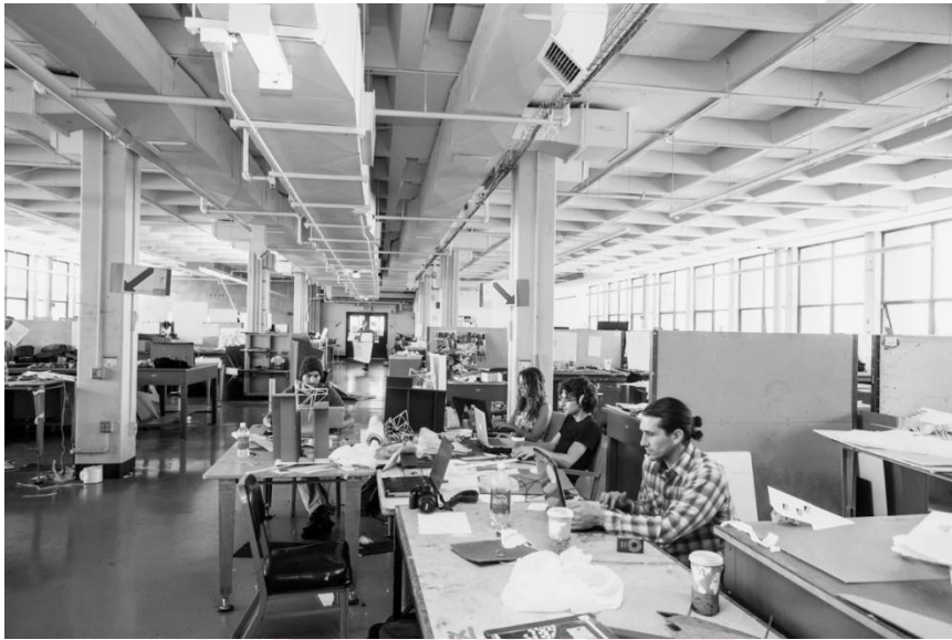
Figure 1.2: UC Berkeley Architecture Studio

Typically students will attend the studio where an academic gives instruction. This usually occurs in small groups of from 12 to 20 students for a period of time from half a day to two days a week. Students will engage in simulated real world activities of designing an artefact to a given brief which outline the goal of the project, user requirements, site condition and other technical information. Students will respond to weekly feedback given by the academic over their drawings, models or diagrams which it calls “tutorial section”. Chart 1.1 is a summary diagram of student design process. Furthermore the project of designing is in itself usually the major component of the assessment activity of the studio. The semester of study typically culminates in a public presentation of the design project, referred to as a crit, at which time it is assessed by a jury of academics (Bender & Vredevogd, 2006).