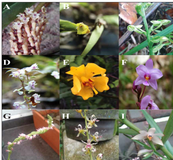
Figure 3. A. Eria robusta (Blume) Lindl. B. Oxystophyllum carnosum Blume. C. Pelatantheria angustata (Ridl.) Ridl. D. Podochilus microphyllus Lindl. E. Spathoglottis aurea Lindl. F. Spathoglottis plicata Blume. G. Spiranthes sinensis (Pers.) Ames. H. Thecostele alata (Roxb.) Par. & Reichb.f. I. Trichotosia gracilis (Hook.f.) Kraenzl.