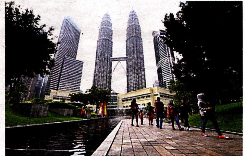
The KLCC Park sets the standard of a park functioning as a connector by linking it to buildings around the area. This has multiple benefits – socially, economically and environmentally. — Bernama

Realising the issues and needs to be faced in future, Osman said the agenda would pave the direction for the landscape architecture practice and for Ilam to play a more influential role in national development.