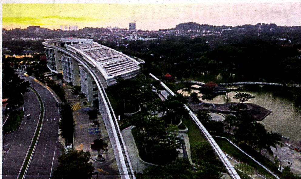
The 'ground to the sky' design element seamlessly connects ground levels to rooftop gardens, and provides continuous green spaces for public enjoyment. Seen here is Laman PKNS in Section 14, Shah Alam.

This year marks the 10th edition of the annual event that recognises