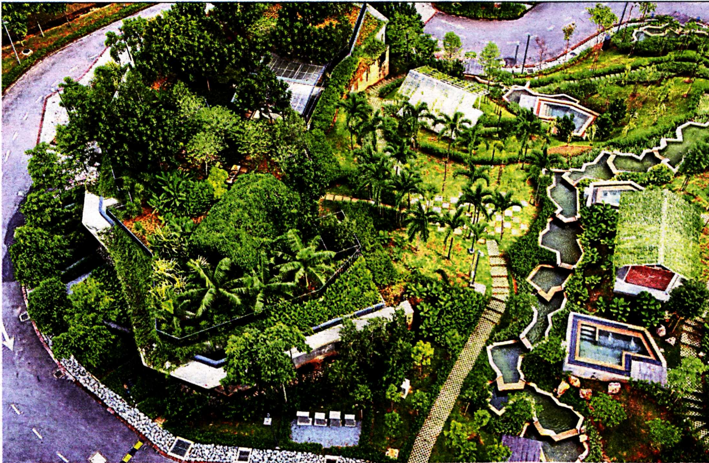
Oval, curved and irregular lines and shapes have taken centre stage as they create a less formal feel to a landscape design. Seen here is Verdi Condominium property in Cyberjaya.