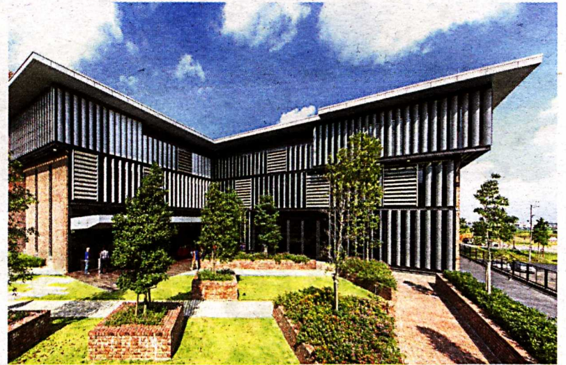
The use of materials such as untreated bricks, flooring and walls, unpolished concrete within buildings and hardscape treatments bring a touch of modernity and lower maintenance costs to the design. Seen here is an example of the raw and seasoned concept used at the Big Dutchman regional head office and warehouse in Bandar Bukit Raja, Klang.

According to him, other iconic projects that made an impact on Malaysia's landscape infrastructure