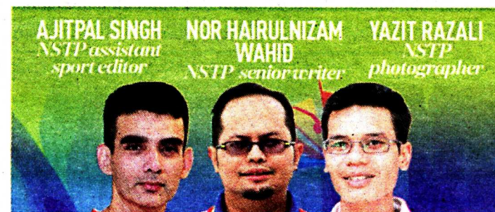
Insightful and exciting reports from NSTP Sport from Gold Coast Commonwealth Games