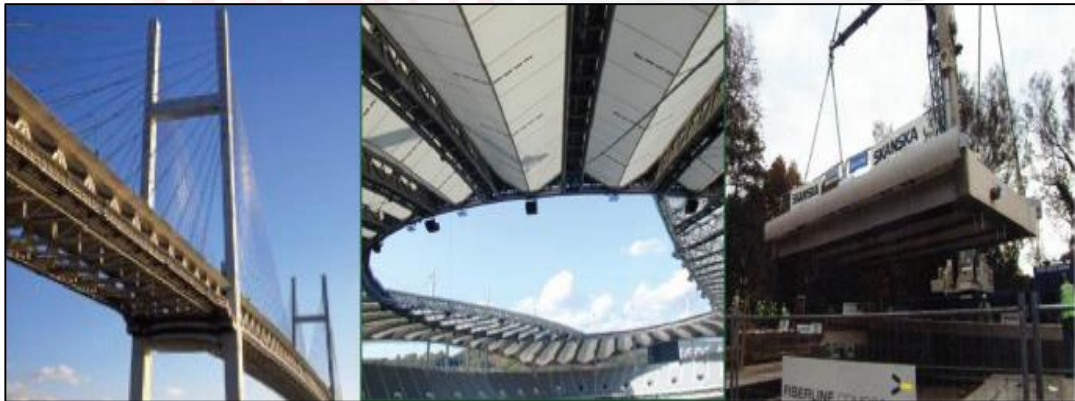
Figure 4: Fibres-reinforced composites for infrastructural parts (Park & Seo, 2011).

In structural industry however, corrosion is one of the biggest problems experienced. As an example, in the marine industry, they start to use composites in boats or ships structure since composites do not corrode like metals. This advantage of composites is also chosen for roads and bridges, since roads and bridges are easily corroded. Composites offer a longer life span with less maintenance due to their corrosion resistance (Campbell, 2006). Figure 4 shows the composite designs in infrastructural applications.