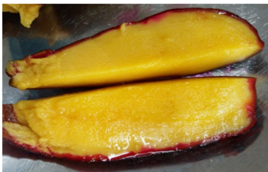
Figure 1. Penetration depth of NaOH analysis on 'Chok Anan' mango fruit

a magnifying glass was used to measure the depth of NaOH penetration (mm) (Kaleoglu et al. , 2004).