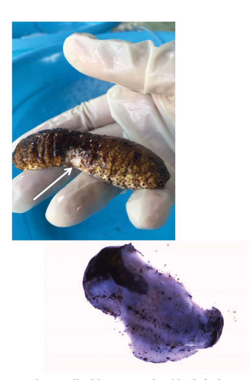
Figure 1. Gross lesions that started as small white spot on the skin (left picture; arrow) that eventually led to mucus surrounding almost the entire body (right picture)

Vibrio Alginolyticus Infection in Juvenile Sea Cucumbers