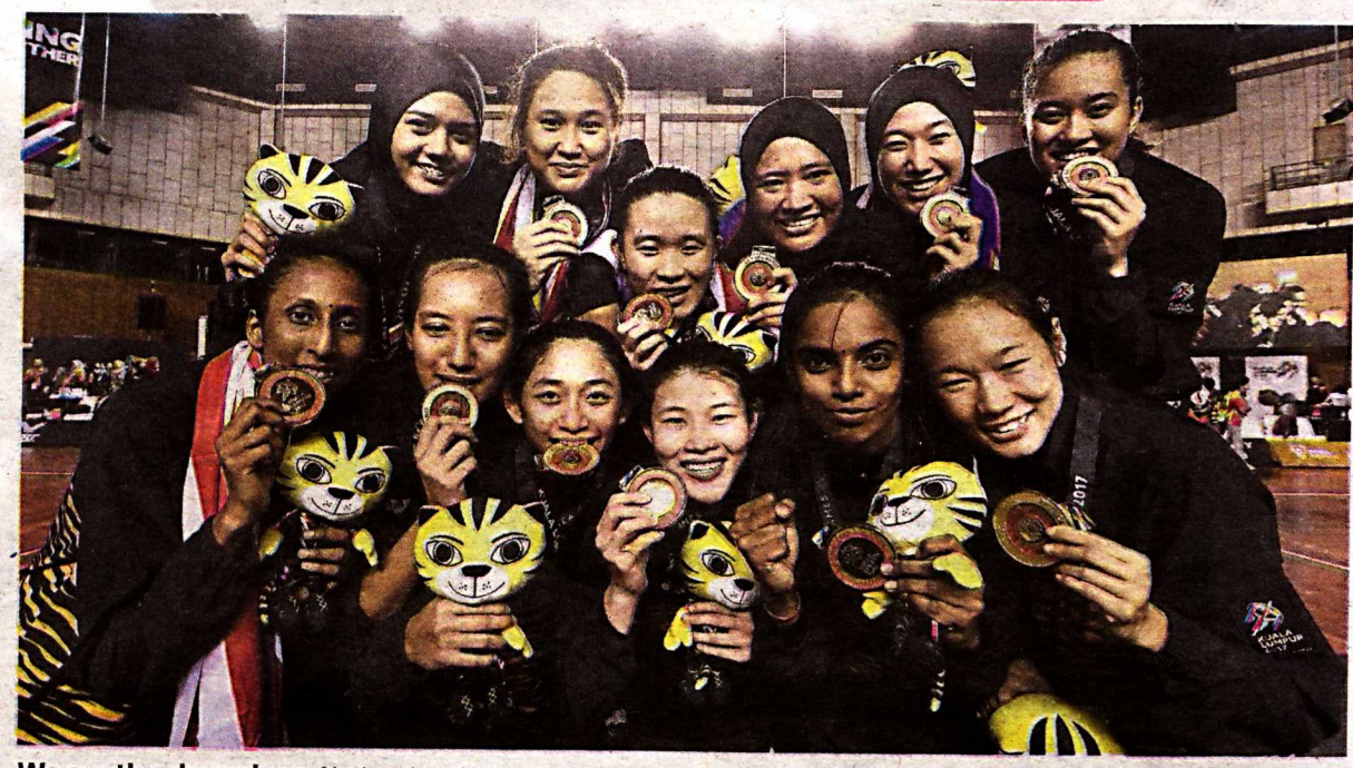
We are the champions: National netball athletes proudly showing off their gold medals after taming defending champ Singapore in the final match.

Malaysia last won the netball gold at the 2001 Kuala Lumpur SEA Games.