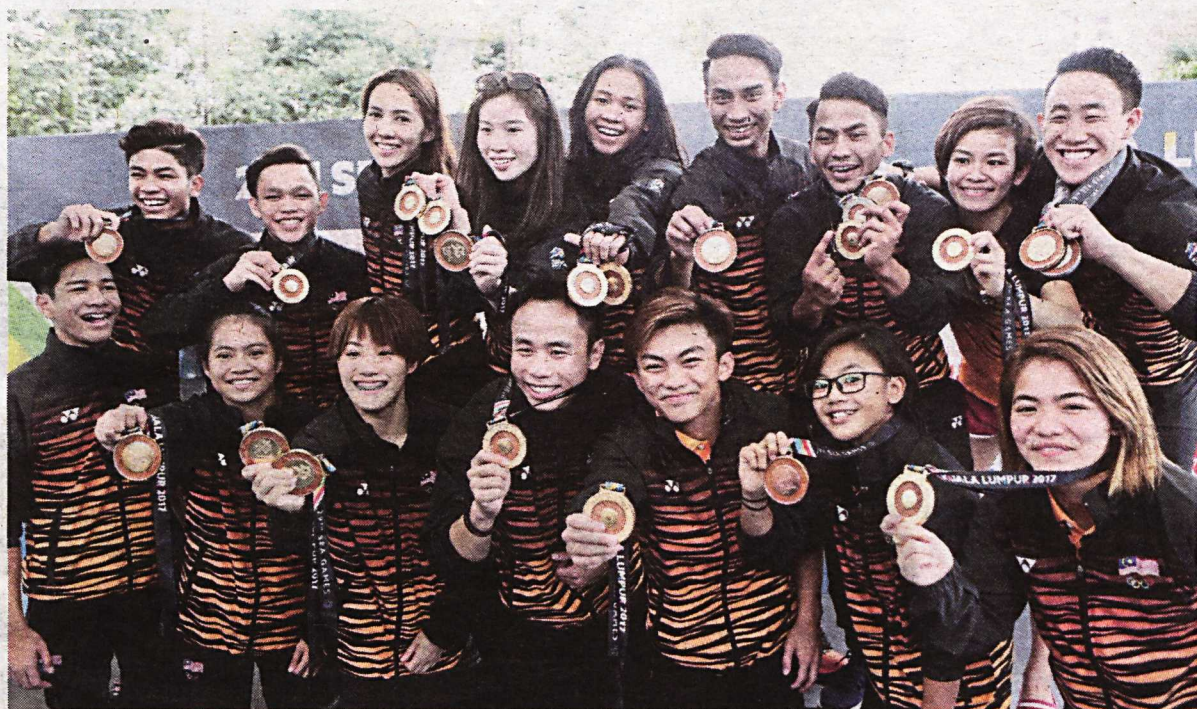
Malaysian divers with their medals at the Bukit Jalil National Sports Complex's National Aquatic Centre in Kuala Lumpur yesterday. PIC BY AIZUDDIN SAAD