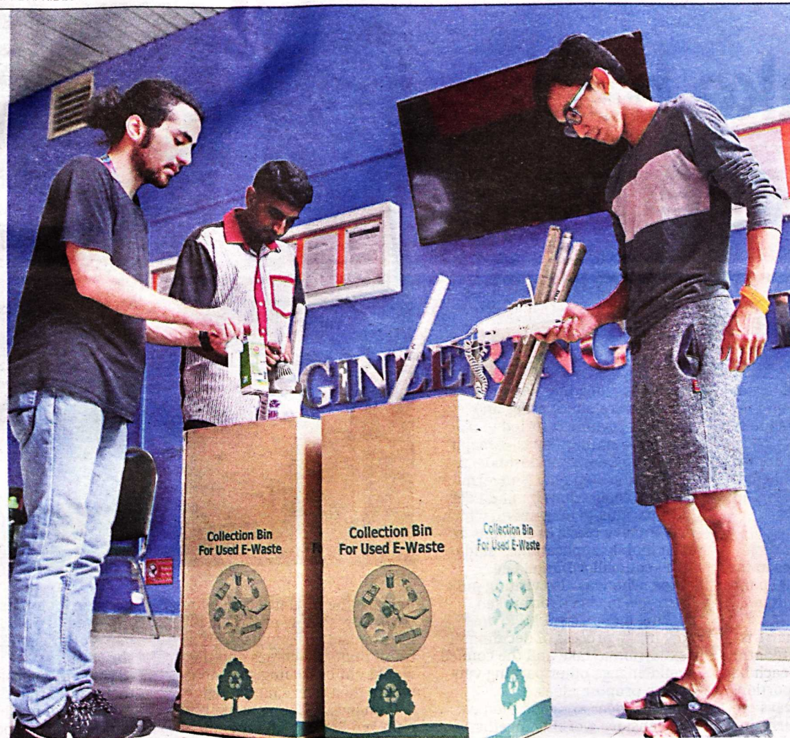
Multimedia University students from the Faculty of Engineering sorting out e-waste collected at their campus.

Electrical and Electronics Association of Malaysia assistant