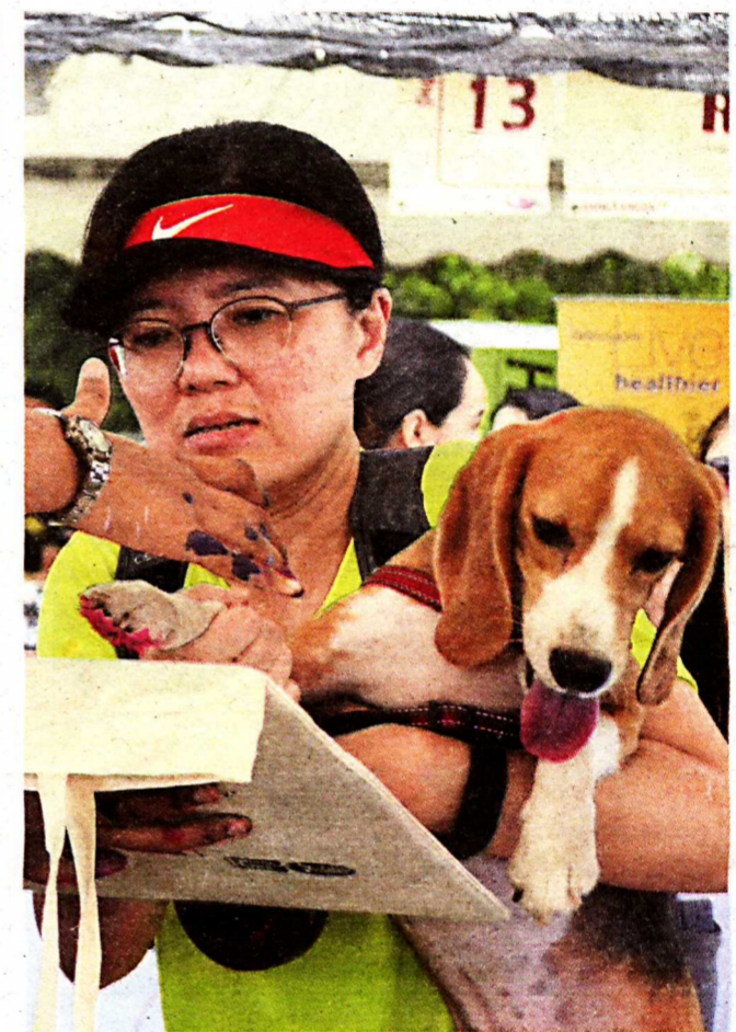
A dog making his mark on a souvenir.