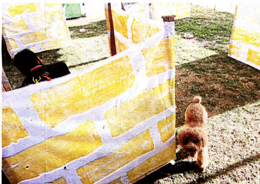
A dog enjoying a game of hide-and-seek.