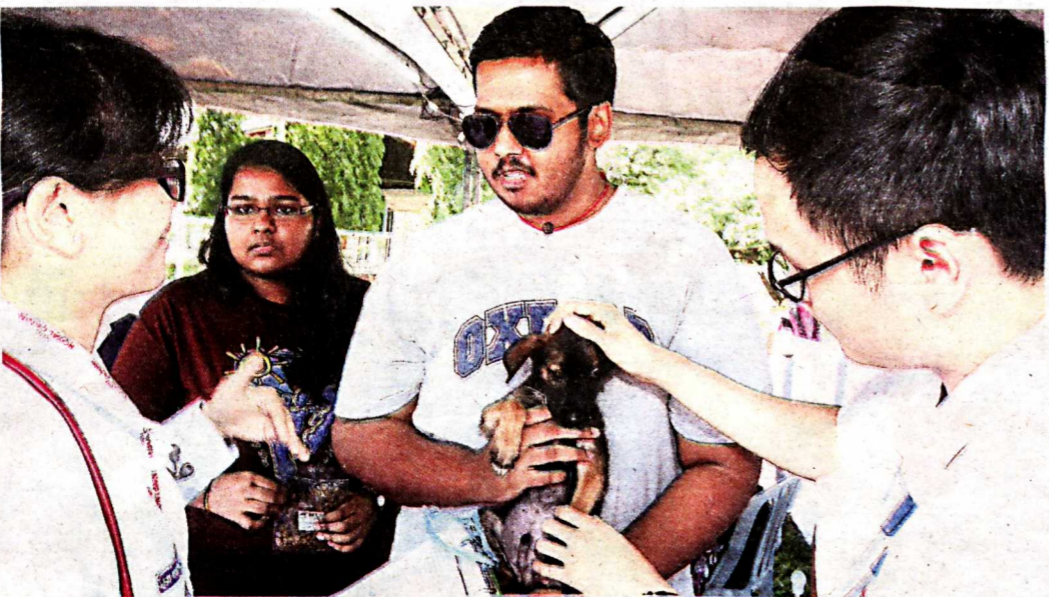
Dogs being examined by UPM veterinary students before entering the venue.