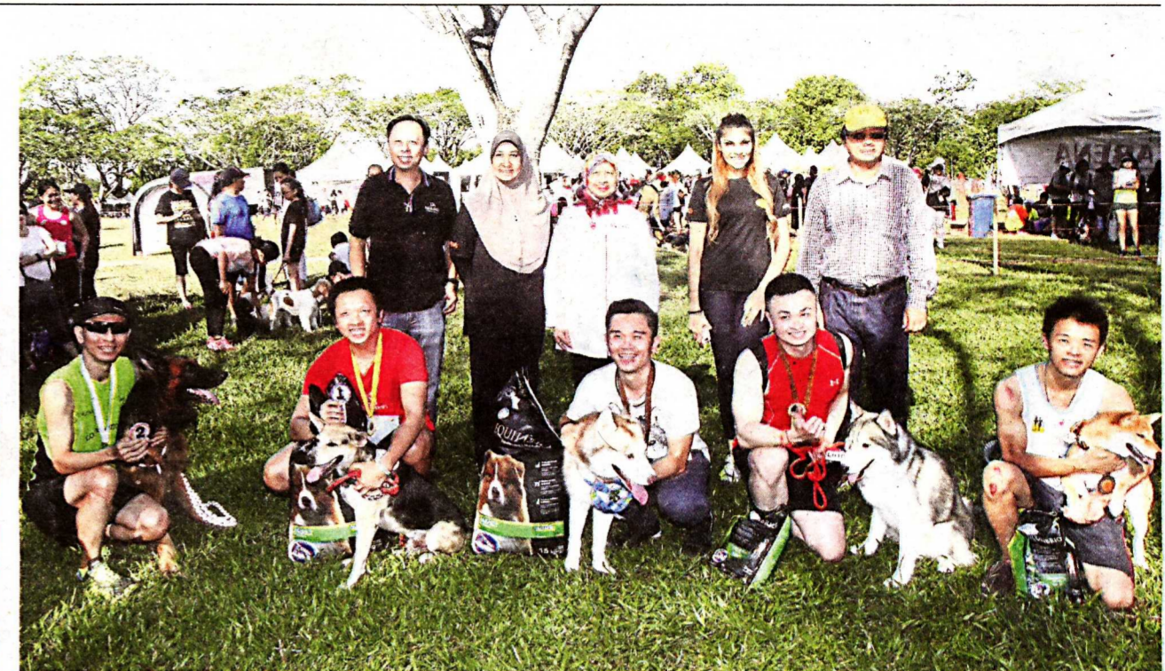
The winners for the men's+large dog category in the Dog Race.