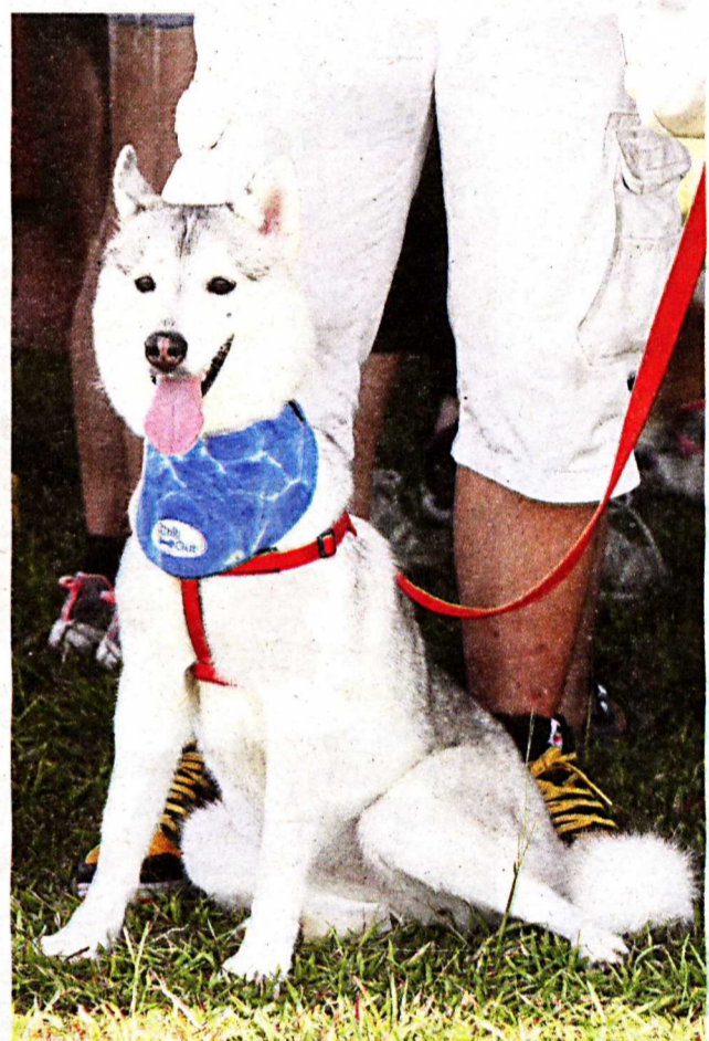
A Siberian Husky looking cute in a bib.