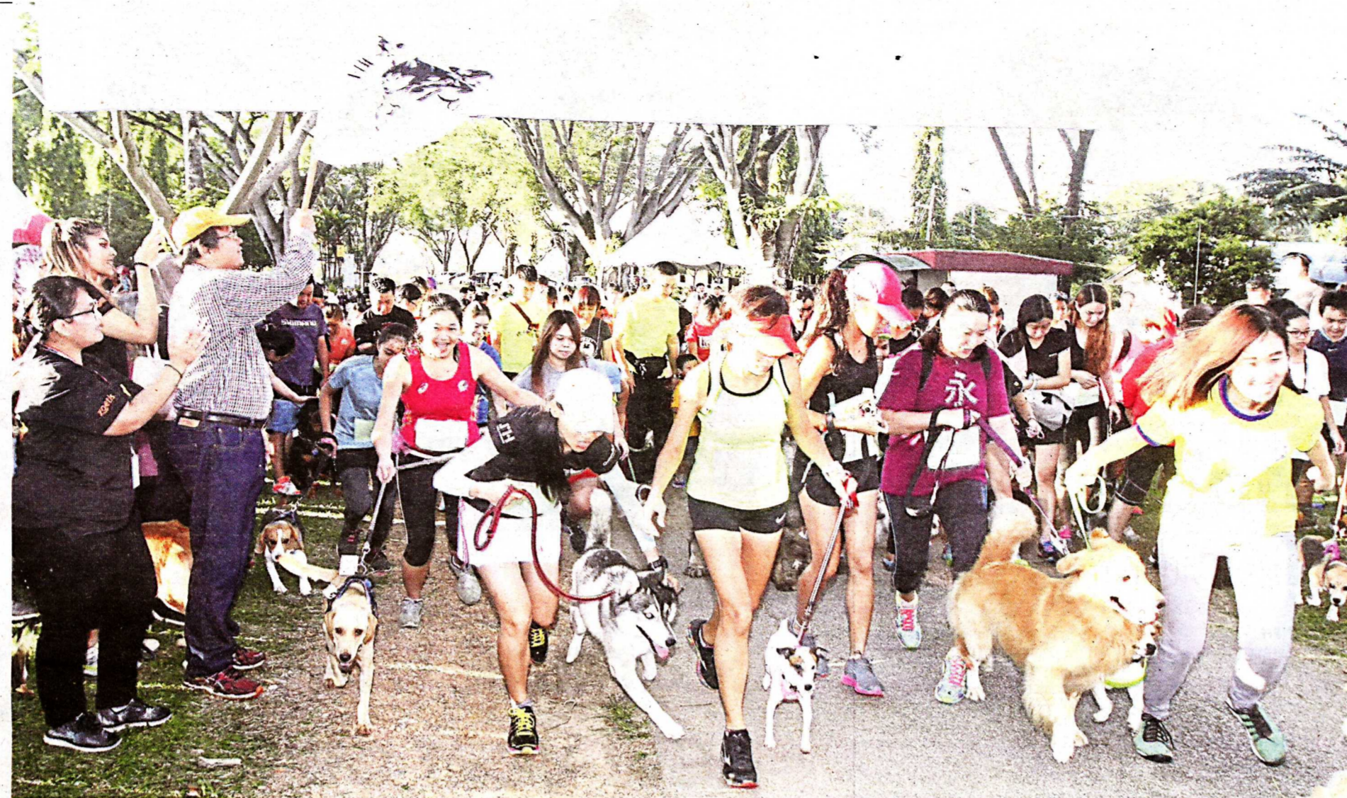
The dog race was the highlight of the Dogathon 2017 at UPM in Serdang.