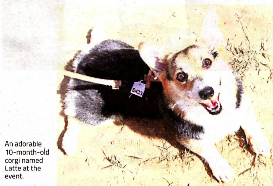
An adorable 10-month-old corgi named Latte at the event.