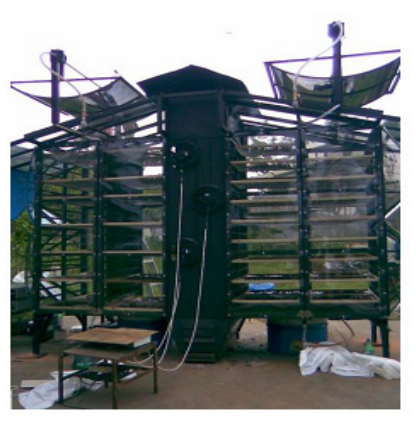
Figure 3(a). Rack-type solar dryer