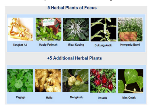
Figure 2. Selected herbal plants for EPP1 program. Source from http://www.moa.gov.my

Several Herbal Cultivation Parks (HCP) has been in operation since 2011 to ensure sufficient supply of raw herbal material for R and D and clinical trials before mass-production. The targeted high value herbs for Malaysia are described in Figure 2 .