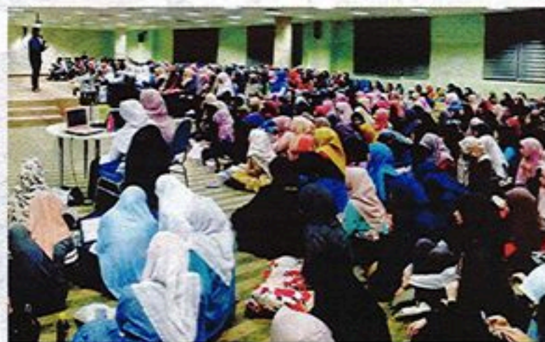
Giving a talk on Aku Budak Dekan at UITM Puncak Alam, 2016.

used as optical fiber, fiber lasers and telecommunications.