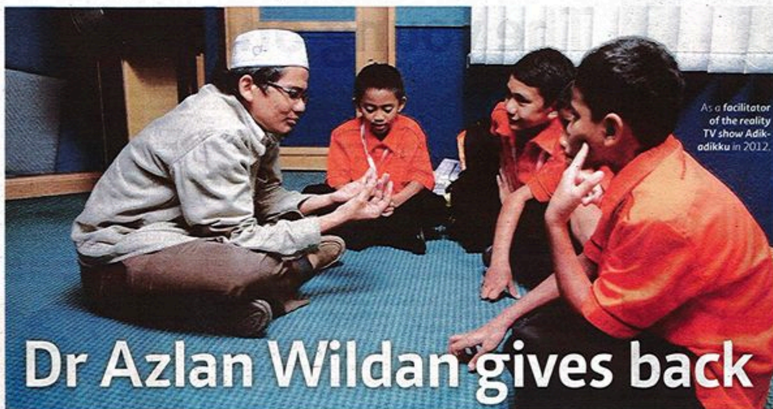
As a facilitator of the reality TV show Adik-adikku in 2012.