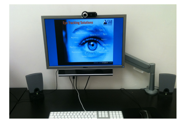
Figure 1: Desktop based eye-tracking equipment where Shuttle-1 was used by researchers to monitor eye-tracking experiment and Shuttle 2 was equipped with an eye-tracking infrared sensor to track the participants eye movements.

Generally, research in eye-tracking focuses on several types of gaze data, including saccades, fixations, dwelling time, and scanpath (Figure 2). Eye movements (gaze) are not a continuous process when viewing pictures or a static scene (Pomplun, 1998). Eye movements that tend to leap from one inspected location to another are identified as saccades, and the motionless positions between those leaps are fixations (ibid). Dwelling time is defined as time durations for individual fixations, while scanpath refers to eye movement patterns that emerge from a sequence of fixations (Jacob & Karn. 2003). Results from other experiments have suggested that the gist of a scene can be comprehended by a viewer with the first few fixations (Duchowski, 2007).