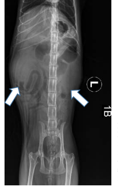
Figure 1. (Top and left) Abdominal radiograph revealed bilateral enlarged kidney suggestive of renomegaly.