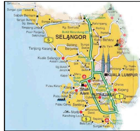
Figure 1 : Location of Putrajaya with other major cities in Klang Valley area.

Located 25 km south of Kuala Lumpur, Putrajaya served as the new federal administrative centre of Malaysia. The shifted from Kuala Lumpur to Putrajaya was due to overcrowding and congestion in the existing Kuala Lumpur area. Nevertheless, Kuala Lumpur remains Malaysia’s national capital, while Putrajaya became Malaysia’s third Federal Territory after Kuala Lumpur and Labuan.