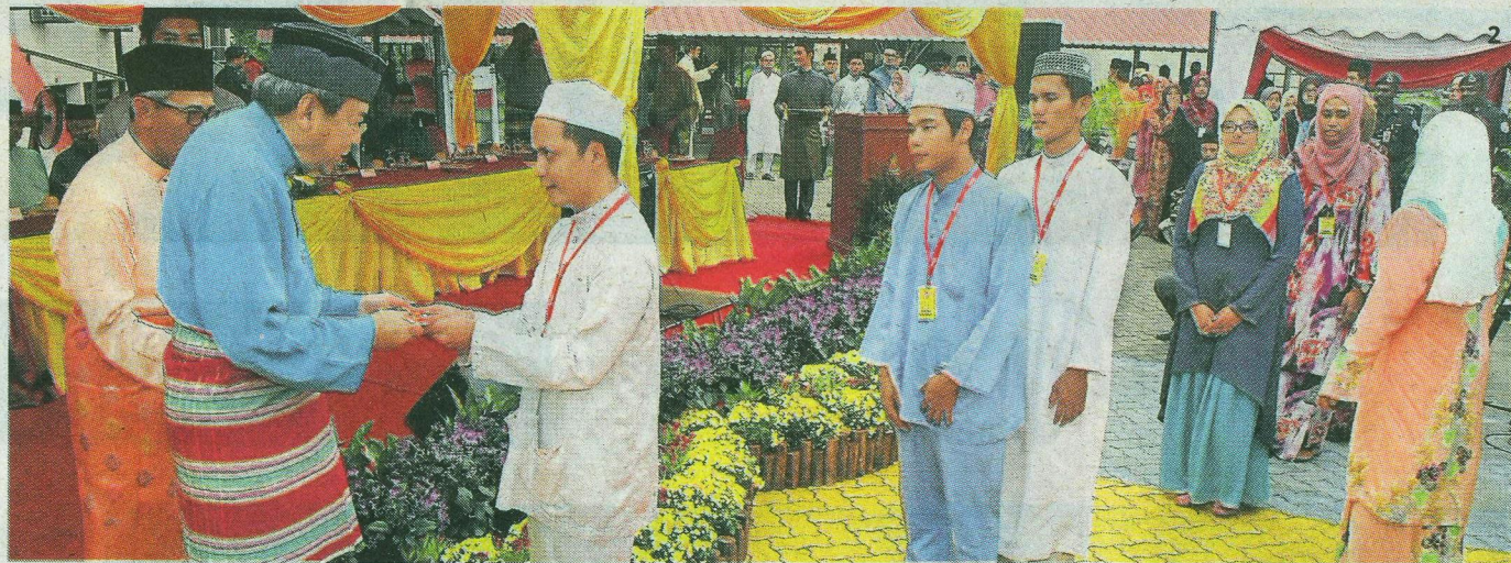
2 Sultan Sharafuddin (second from left) distributing Hari Raya alms to the students.