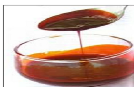
Red fruit oil