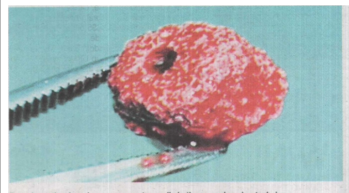
Bone formation from bone marrow stem cell via tissue engineering technique.

They may be relatively new fields here but the results of stem cell research and tissue engineering have been outstanding, writes KASMIAH MUSTAPHA .