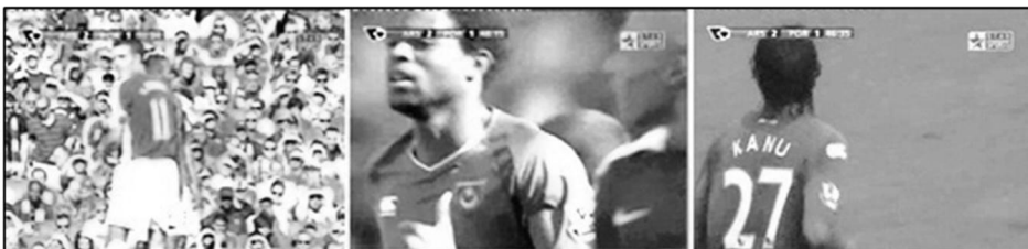
Fig.3: Close-up views