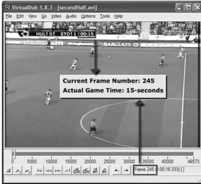
Fig.5: Manual determination of the reference frame and time

The values t^{ref} and f^{ref} can then be used to localize the event search to the one-minute eventful segment. With t_i^g being the minute time-stamp of the goal event, the beginning ( f_{i,begin}^g ) and ending ( f_{i,end}^g ) frames for the event minute can be determined via: