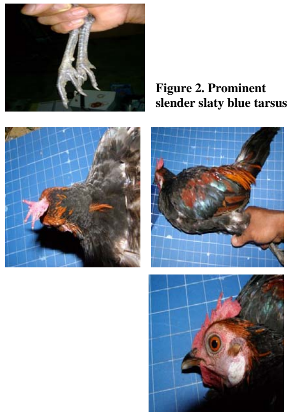
Figure 2. Prominent slender slaty blue tarsus