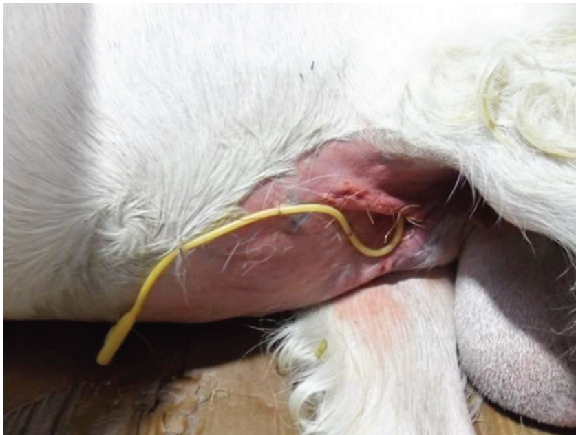
Fig.3: Post bladder tube cystotomy procedure where the end of the Foley catheter was hung outside the abdomen.

Then a purse string suture pattern using an absorbable suture material 2-0 Vicryl (Coated Vicryl [Polyglactin 910] Suture Undyed Braided, Ethicon LLC) was placed on the ventral surface of the bladder wall. A stab incision was made in the mid region of the purse string pattern, and the tip of the Foley catheter (size 8Fr) including the deflated balloon, was inserted into this small bladder opening. Once the catheter had been placed in the bladder, the purse string suture was tightened to secure the catheter, and then the balloon on the catheter was inflated with air. The abdomen was lavaged with warm sterile saline, followed by suctioning out of the fluid. Then the peritoneum and muscle layers were closed with continuous suture pattern (2-0 Vicryl), followed by