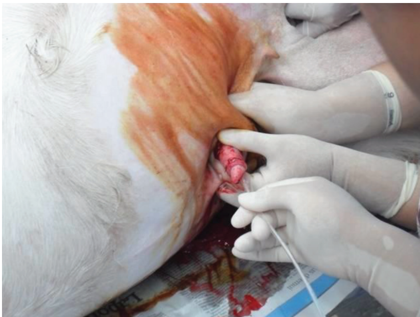
Fig.1: Attempt to catheterise the urinary bladder using a large dog urinary catheter to relieve the distended bladder.

On the first day of hospitalisation, the serum biochemistry result revealed azotemia, hypophosphatemia, hypochlorademia and lymphopenia. Urinalysis results revealed that the goat was having proteinuria, and presence of inflammatory cells with bacteria (1+), which is suggestive of lower urinary tract infection. The goat was observed throughout the night in case of a bladder rupture, as surgery could not be