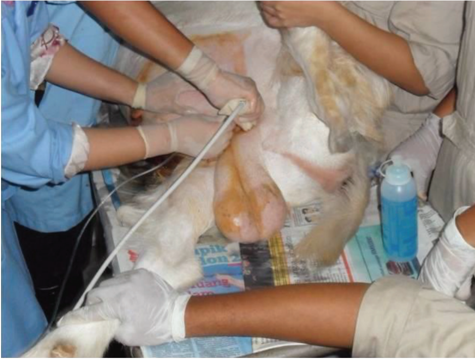
Fig.2: Ultrasound-guided cystocentesis was performed and about 230 mls of urine was aspirated out.

performed on that day. By late evening, it had started panting, tachycardic (112 beats per minute), having high rectal temperature (42°C) and anuric (despite the effort to urinate). Analgesic drug of flunixin meglumin (Flunixin 50 mg/ml, 2.2 mg/kg, intramuscularly, Norbrook Laboratories (GB) Limited) and broad spectrum antibiotic of penicillin (Benacillin 1 ml per 25 kg, intramuscularly, Troy Laboratories Pty. Limited) were administered. By midnight, the goat's strenuous straining efforts had only produced dribbling urine, and no more urination was observed after that.