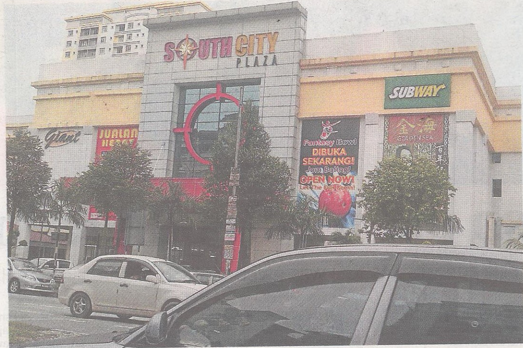
South City Plaza is a convenient place to shop.

but the park has been closed since September 2011.