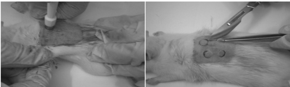
Figure 1. Circular wells were made using a biopsy punch

In young rats, wound treated with honey had the fastest rate of healing compared to other groups (Figure 3). Three of ten treated with honey showed complete healing on day 9 when the skin surface has completely apposed.