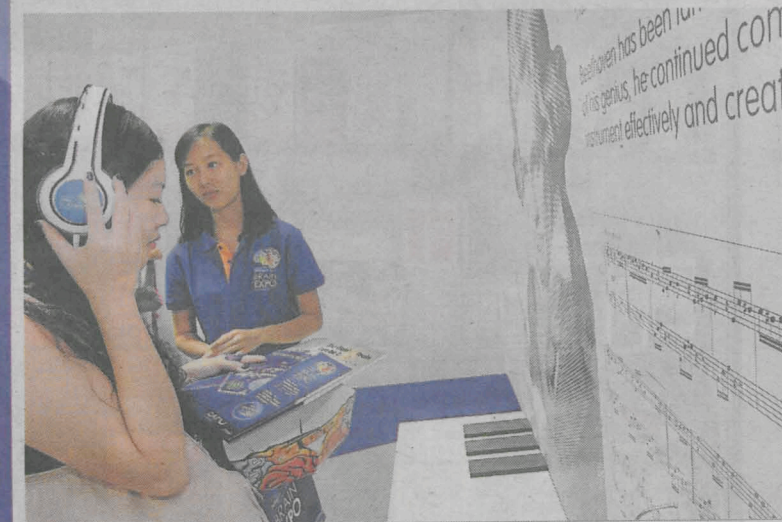
Serenading baby: A patron listening to one of Beethoven's compositions at the Genius Room.