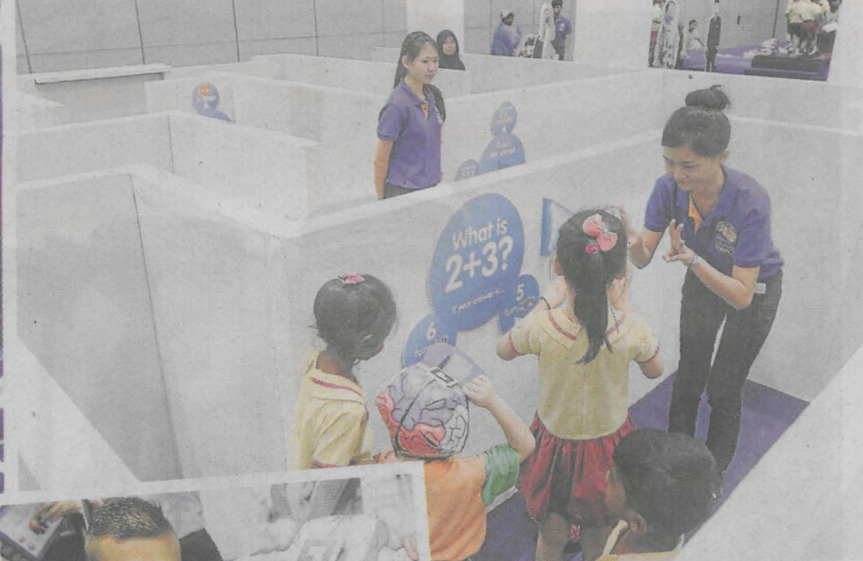
Guided exploration: A Brain Expo ambassador directs kindergartners through a maze.

Enfagrow A+ caters 75mg DHA in three servings per day, measuring up to the recommended dosage when included in a child's regular diet.