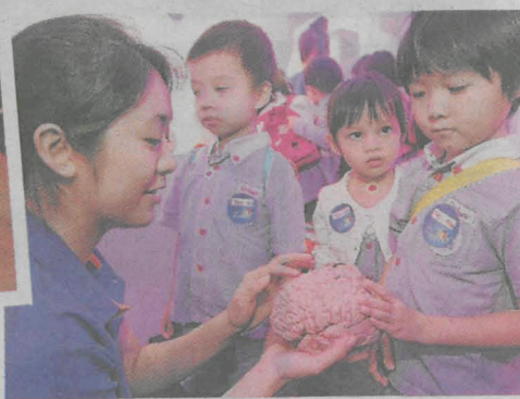
How it works: An ambassador explaining the different parts of the brain to a child at the expo.