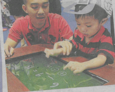
Tickling brains: A child solving math equations at one of the game stations.