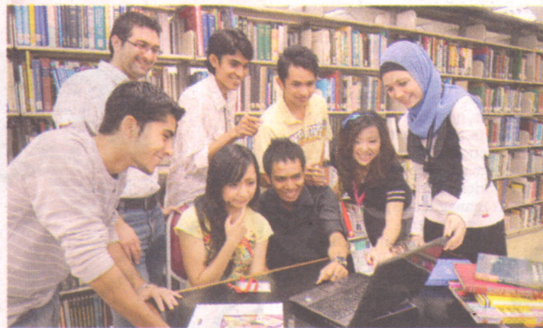
The university offers programmes in more than 250 fields of study.

At UPM, research activities embrace 15 centres of excellence and there are more than 85 research laboratories. The university has the highest number of academic staff with doctoral qualifications and more than half the products