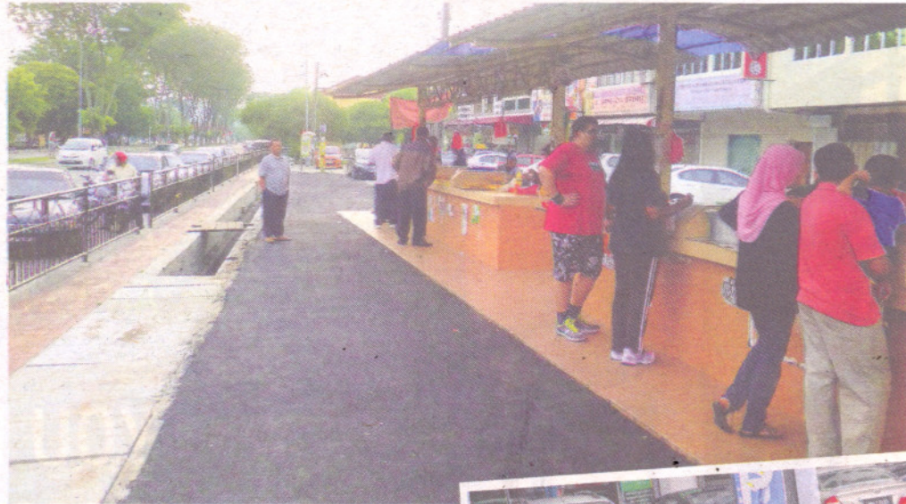
Covering up: MPSJ's Clean Zone programme for Zone 20 included covering drains at the MPSJ hawkker kiosks in Seri Serdang.

MELBOURNE CBD LANDMARK THE POWER OF LEVERAGING AND BUILDING THE FUTURE