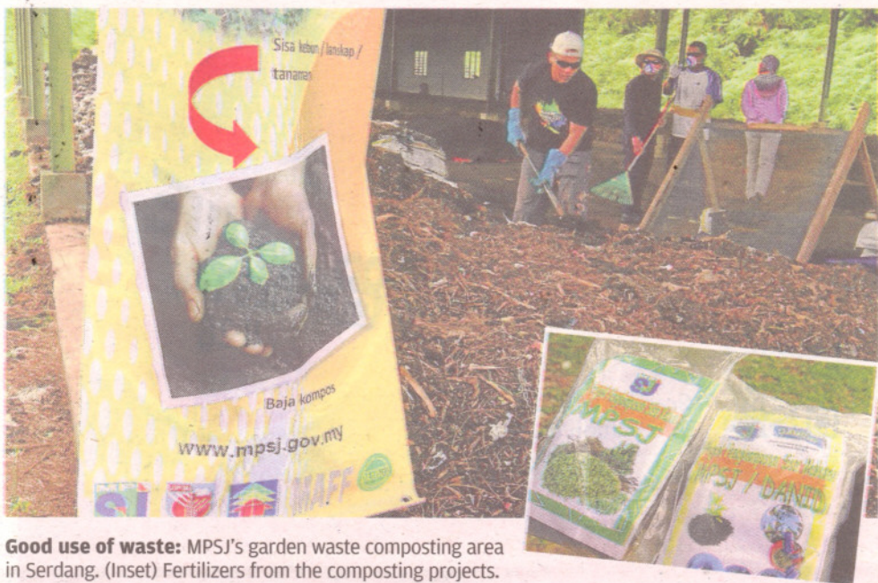
Good use of waste: MPSJ's garden waste composting area in Serdang. (Inset) Fertilizers from the composting projects.

He said interested parties can contact MPSJ's environmental department at 03-8026 4366 or 03-8026 3180.