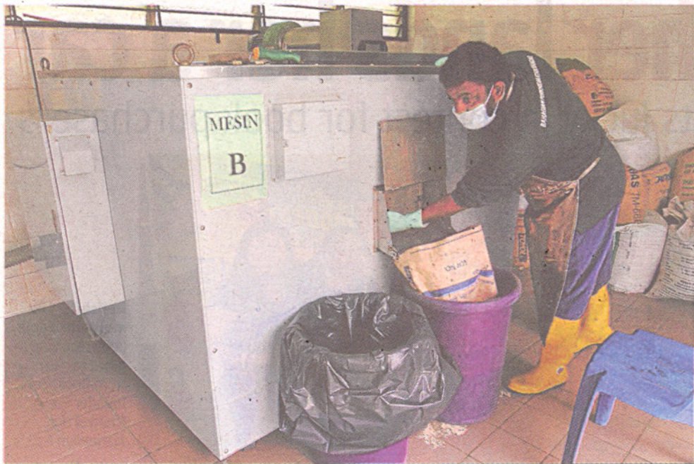
Growing enterprise: An MPSJ worker taking out the fertiliser processed from food waste at a biomass centre in USJ, Subang Jaya.