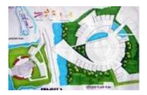
Figure 2: Presentation of site plan completed fully manual.