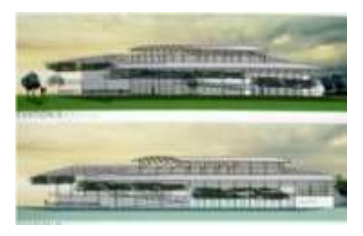
Figure 7: Boring silhouettes of fully digital design alternatives.