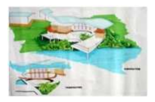
Figure 3: Presentation of a perspective using Full Manual Mode.