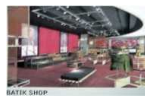
Figure 5: A computer generated interior space.