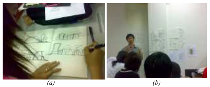
Figure 1: (a) Individual and (b) group activities of students.

visual literature to create some preliminary forms and then evolve them into more complicated masses while considering aesthetical rules and other relative polices, e.g., logical circulation and structural considerations; c) begin simply with bubble diagramming that inspire meaning to diagrams during iterative design lifecycle process; and d) recall some gestalts from their mind for weighing site factors (e.g., culture, climate, people's lifestyle, etc) and adapt function to the form during design.