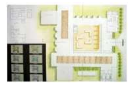
Figure 4: Presentation of a project with no aid of computer.