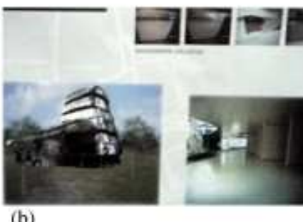
Figure 8a and 8b: A successful project done using multiple digital and manual representation techniques during design process