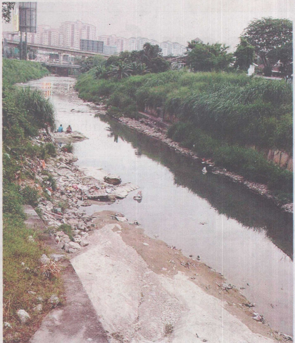
Not complete: The embankments are either half complete or inadequate.

River silting has become a major concern as it leads to flash floods and other social, environment and health problems. StarMetro visits Sg Kayu Ara in search of the real issues behind the silting.