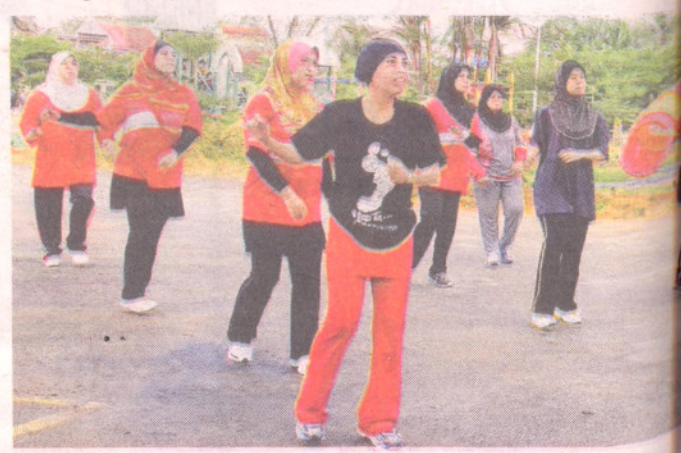
Healthy activity: Women from the Seri Serdang area joining the morning aerobic exercise