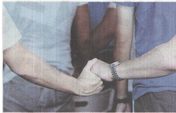
Many MSM have girlfriends or are married but occasionally have sex with men.