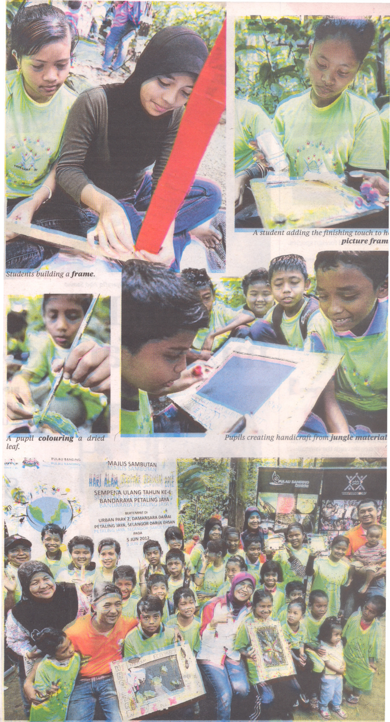
World Environment Day was celebrated on a grand scale at Urban Park 2 in Damansara Damai.