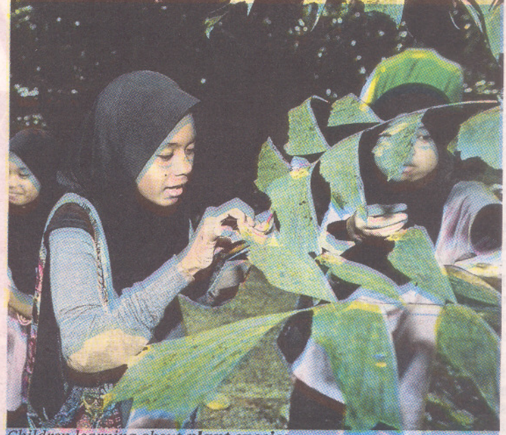
Children learning about plant species.